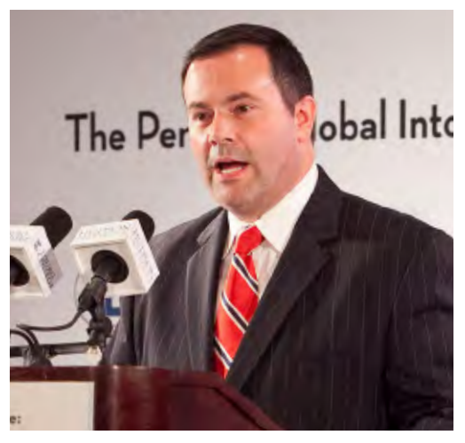
Canadian Minister Jason Kenney

Governor Huckabee said Mr. Ahmadinejad should have been "laughed out of the U.N. General Assembly rather than tolerated... What an absolute absurdity to allow that man to walk into a building not far from where we sit today and to give him a forum and allow him to spew the venomous hatred, the venomous bile that he was able to, and get worldwide attention for it. As a nation, our policies over these past couple of years has been to put more pressure on Israel for building communities and essentially building bedrooms in Judea and Samaria (the West Bank) than we have put pressure on the Iranians to stop building a nuclear bomb that is pointed at Israel and ourselves. This is absurd."