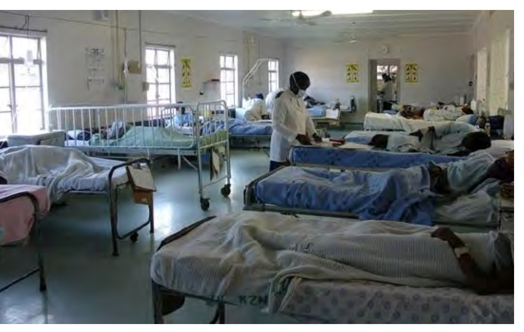
Rural hospital tuberculosis ward, KwaZulu-Natal, South Africa

"These antiretrovirals, which allowed people to live with HIV and AIDS, only became available in South Africa in the fall of 2003, largely through the activities of the Treatment Action Campaign. I worked with them in terms of bringing my perspective and work into the organ-