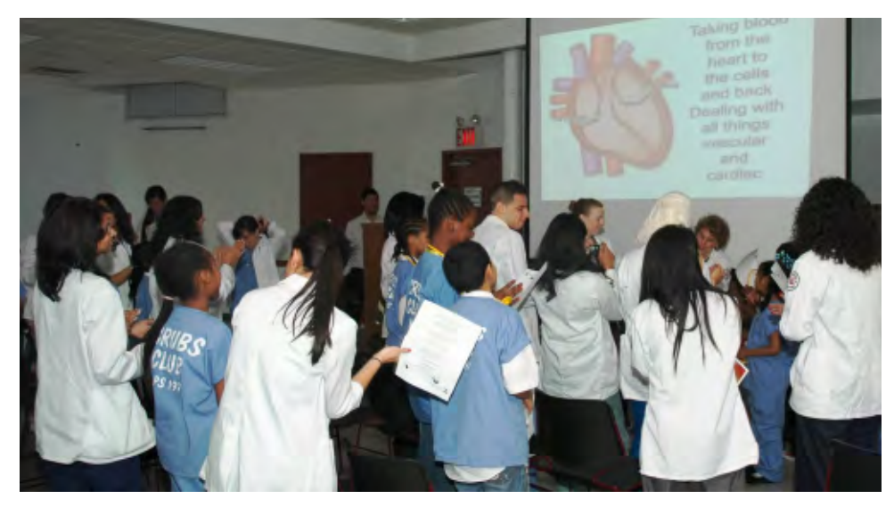
Scrubs Club members and PA faculty, staff and students dance to "Circulatory Song"

Club students and PA faculty and staff danced, sang and clapped to the "Circulatory Song" about how the heart pumps blood throughout the body.