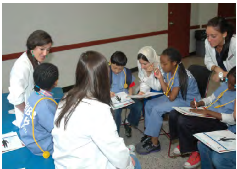
PA students give Scrubs Club members anatomy lesson at 'PA for a Day' program