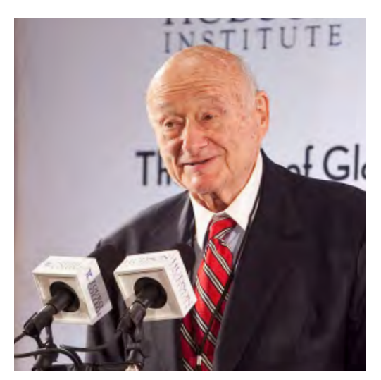
Former NYC Mayor Ed Koch

down in history next to another city called Nuremberg...Does no one recognize the need for a single, neutral standard of human rights? For shame, for shame."